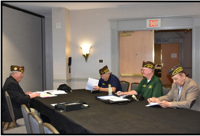
State Quartermaster continued from page 1

will help when planning expenditures for the balance of the year.