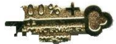
Pin Every Post 100% to 102%