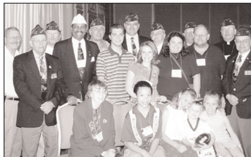
ABOVE: Department Convention visited by National Home (Florida Home)