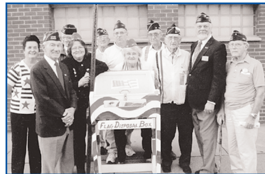
Post #2332, Johnson City – darn nice picture and project!