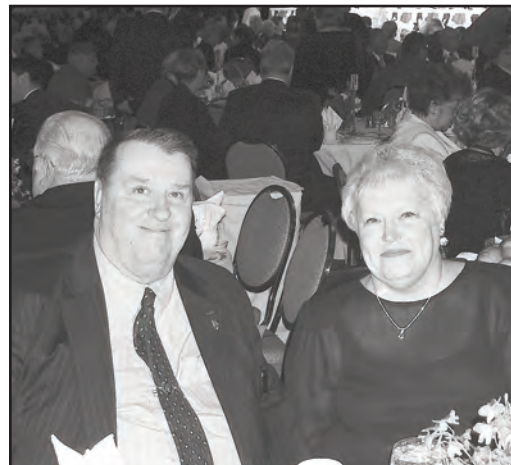
Two more pretty faces at the Washington Conference - GUESS WHO?