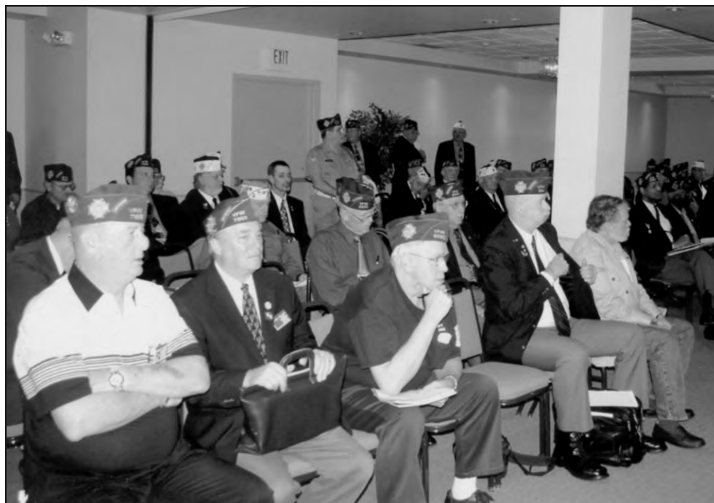
Spring Conference – lots of meetings? YES! Lots of business to do!