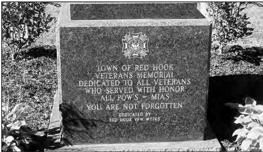
Memorial Park – sponsored by Post 7765, Red Hook.