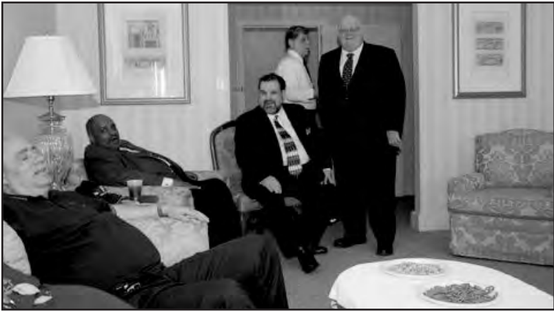
National Legislative Conference is exhausting, and everyone needs a break.