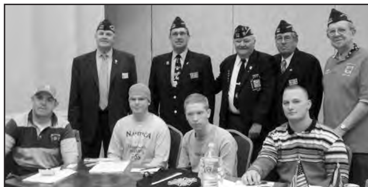
Membership recruitment never stops, four new ones in the front row at the Albany Conference.