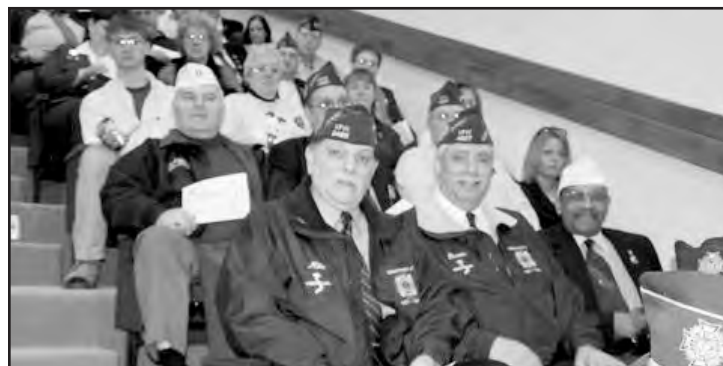
Albany Legislative Conference heavily attended.