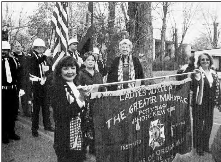
A traditional ceremony at the cemetery honoring our fallen veterans. A community celebration was held at the Post open to the community.