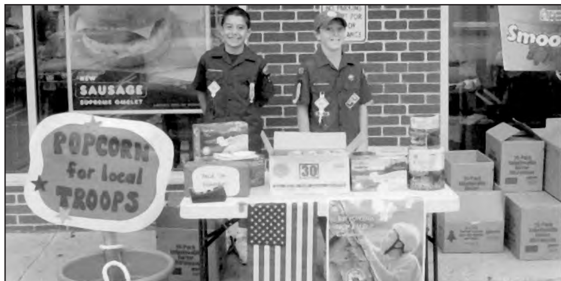
Cub Scout Pack 124 in Ridgefield, CT, sold popcorn as a fundraiser. On one day, the children setup stations throughout the town selling their products. Prominently displayed at each station was a large blue bucket with a sign "POPCORN FOR LOCAL TROOPS." They collected $2500 worth of popcorn to send overseas to our fighting men and women, which they gave to Post 672 to ship to troops serving in Iraq.