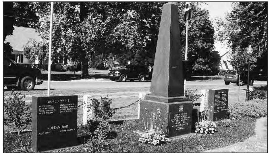
Memorial Park – sponsored by Post 7765, Red Hook.