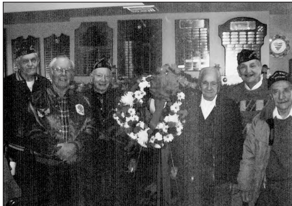
Celebrating Pearl Harbor Day.