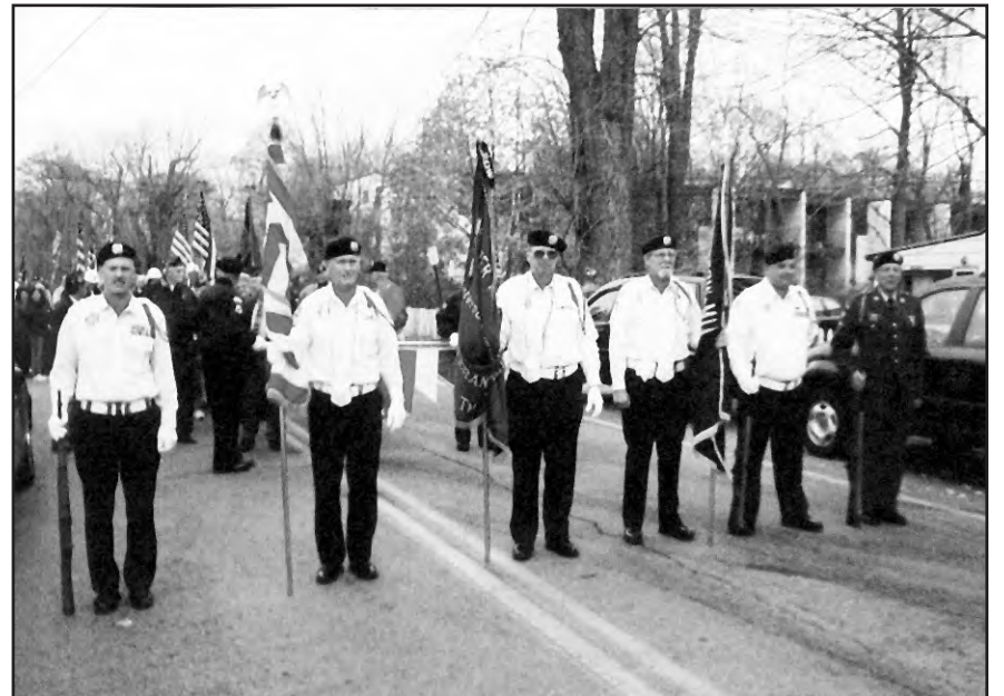
District 2 Color Guard, Post 5491