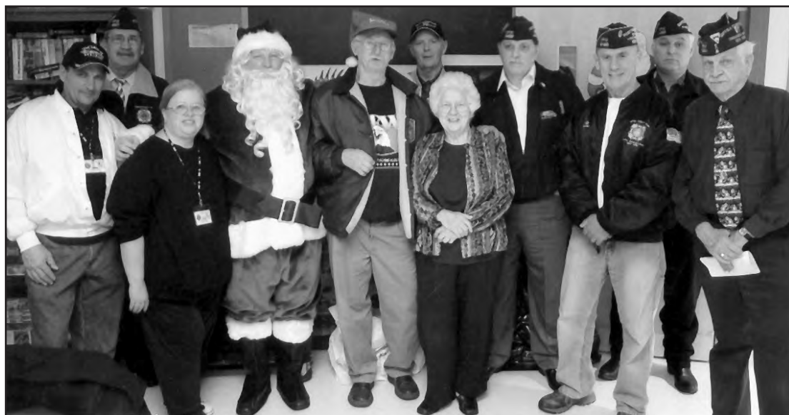
Suffolk County Council have Christmas Party at the Northport VA.

On Sunday, December 17, VFW Suffolk County Council and its Ladies Auxiliary (D1) presented the Long Island State Veterans Home at Stony Brook with items requested on their Wish List.