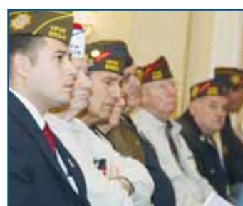
Just a nice shot.