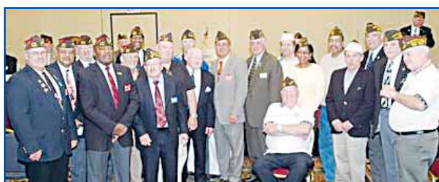
Many members brought checks for the Commander's Special Project, "Fisher House." If you want to help bring a check or send it to the Department.