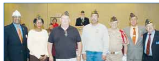
Happy and proud donors to the National Home.