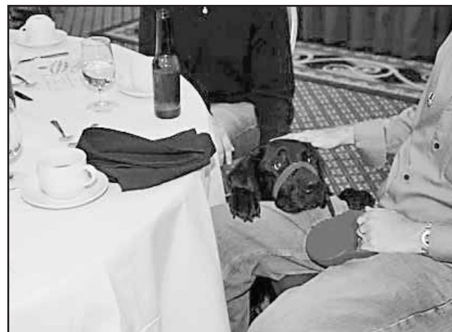
Check out the loving dog loving his vet!

NEADS' dogs serve as Walker Dogs when the veterans are ambulatory and walking with their prosthetics. They provide balance when walking, going up and