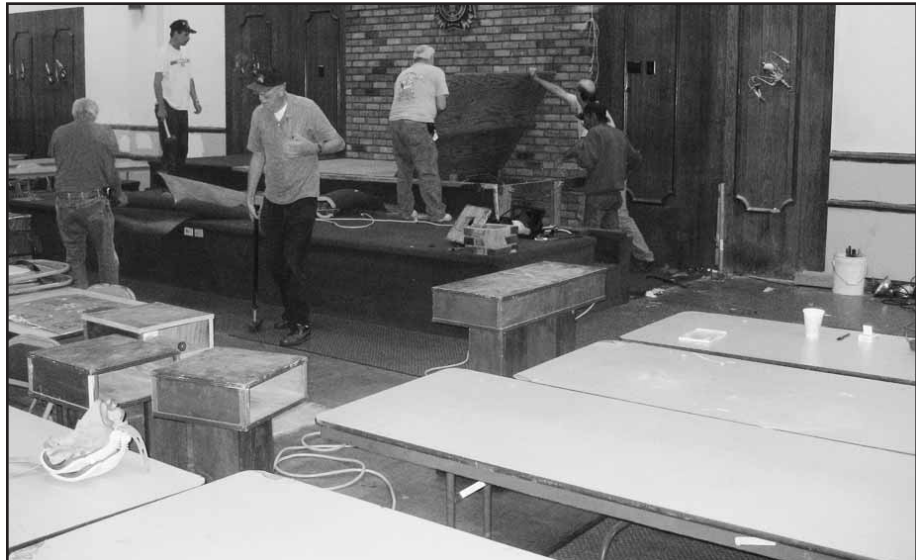
Taking the old stage apart.

Commander Dennis Sullivan Post #4927 Centereach would like to render a PERSONAL THANKS to all the members and Auxiliary that helped with the renovations.