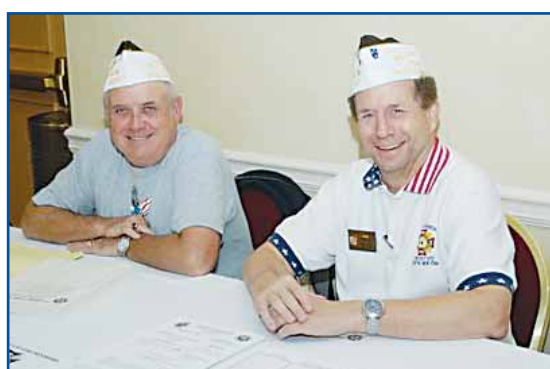
Post #672 Brewster and Post #5913 Wappingers Falls are well represented, and they enjoy their work.