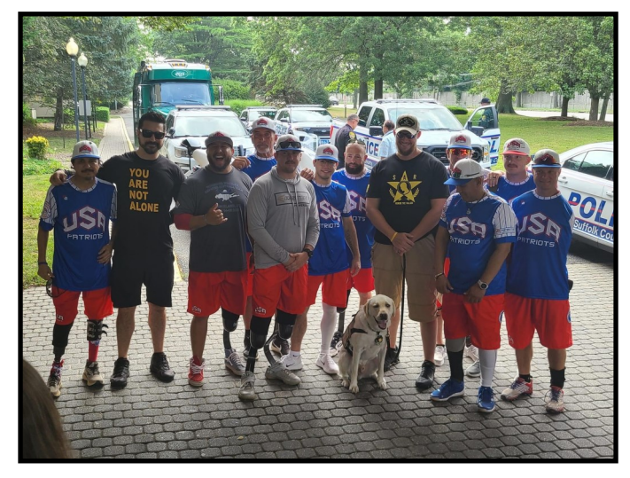
Veteran 5K Run, the 22-a-day PTSD Awareness Challenge, many Patriot Day remembrance